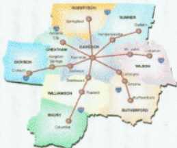
Proposed Regional Commuter Transit Network

The East Corridor, connecting Wilson and Davidson counties, was selected as the initial corridor for a Regional Commuter Transit Network for a variety of reasons. The most significant reason is the existence of a public railroad with available capacity. In addition, 2000 Census data shows that 45% of Wilson County residents commute into Nashville/Davidson County each day for work.